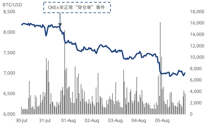
比特币价格及交易量 (7月30日- 8月5日)