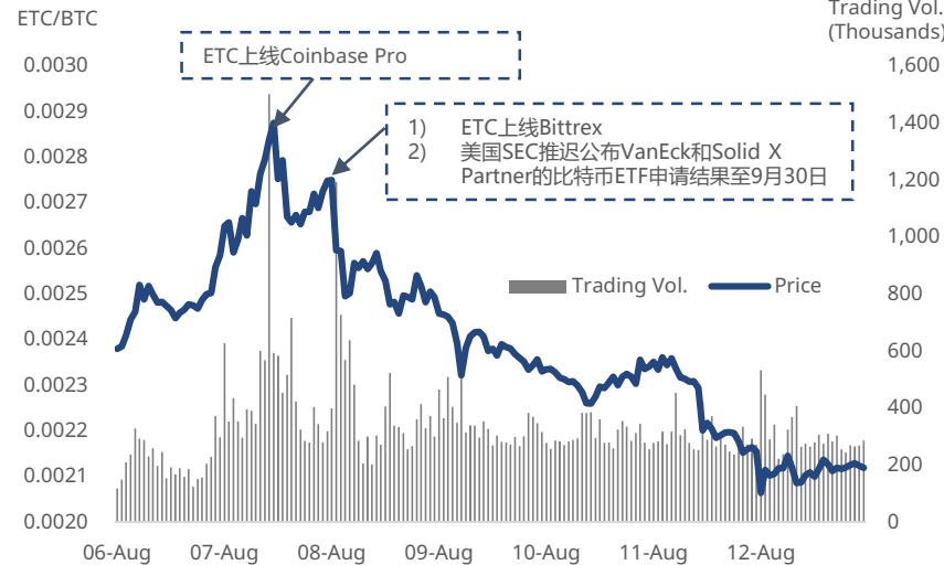
ETC价格及交易量 (8月6日 - 12日)