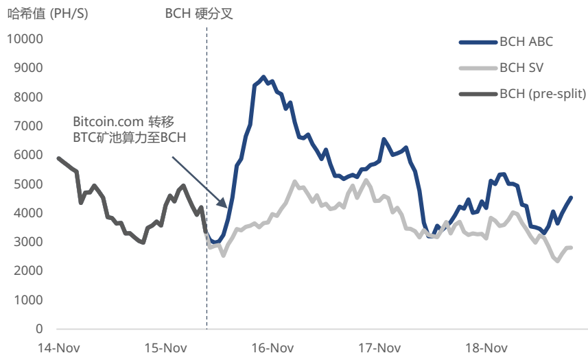
BCH, BCH ABC和BCH SV哈希值 (11月14-18日)